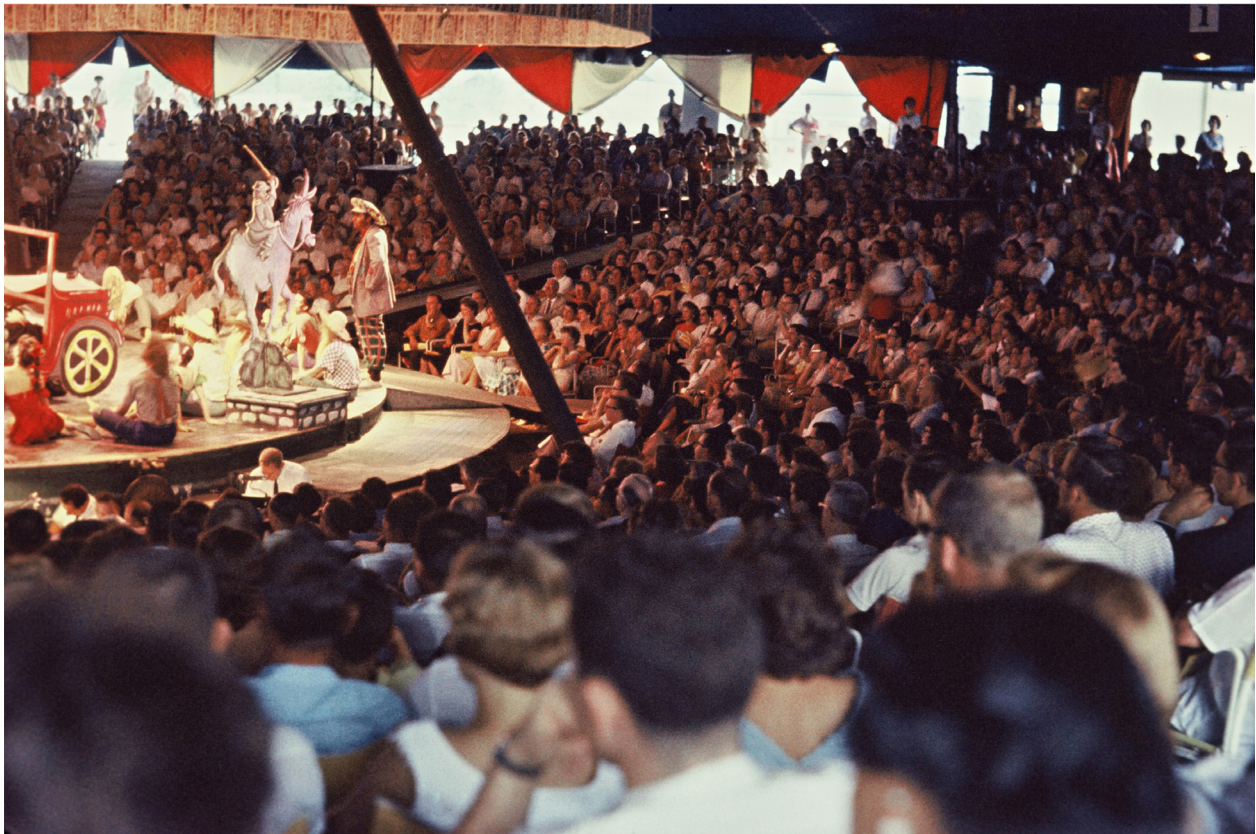
A packed house for Li'l Abner